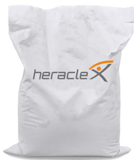
Heraclex® life200_1.0 is available in 20 kg bags.

State: Powder Colour: Ivory Apparent density: max. 0.700 kg/dm 3 Grain size: min. 98 % < 0,600 mm Content in chloride: max 0,05% Humidity: max. 6 % Water solubility: partially soluble Temperature of use: > 0°C Storage: dry and protected place